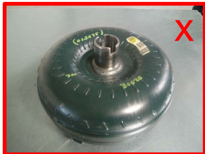
painting due to external repair / remanufacturing by 3 rd party remanufacturer → not acceptable