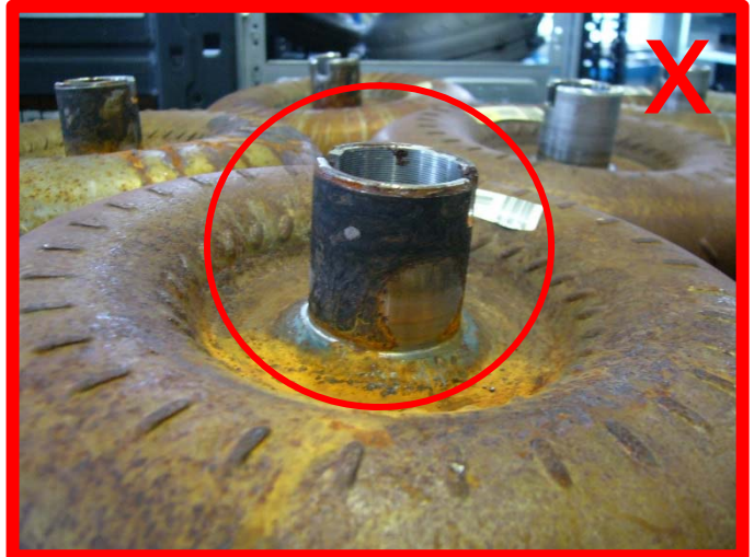
Severe corrosion, fretting corrosion (especially on hub) → not acceptable